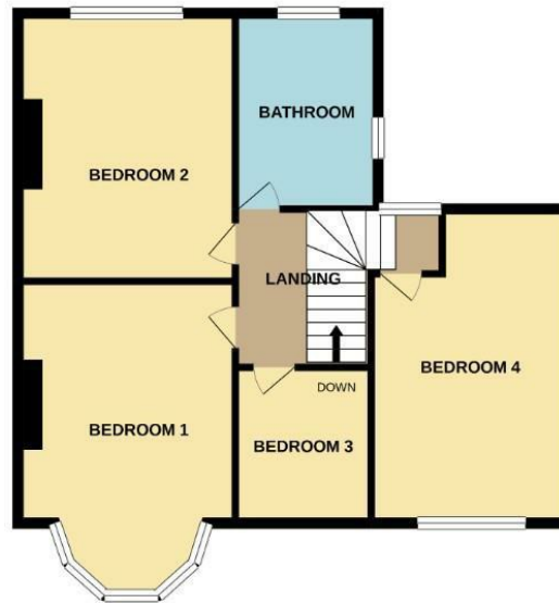
1ST FLOOR 690 sq.ft. (64.1 sq.m.) approx.